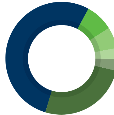
MSCI All-Country World Index, as of 12/31/16.

Non-U.S. markets compose roughly half of the global opportunity set.