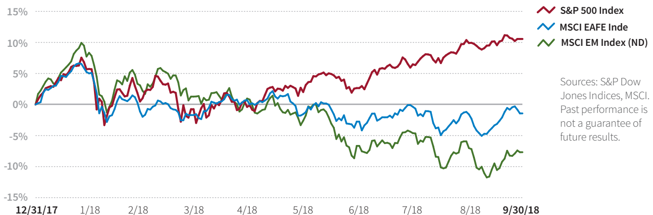
Total return performance, 12/31/17–9/30/18

Sources: S&P Dow Jones Indices, MSCI. Past performance is not a guarantee of future results.